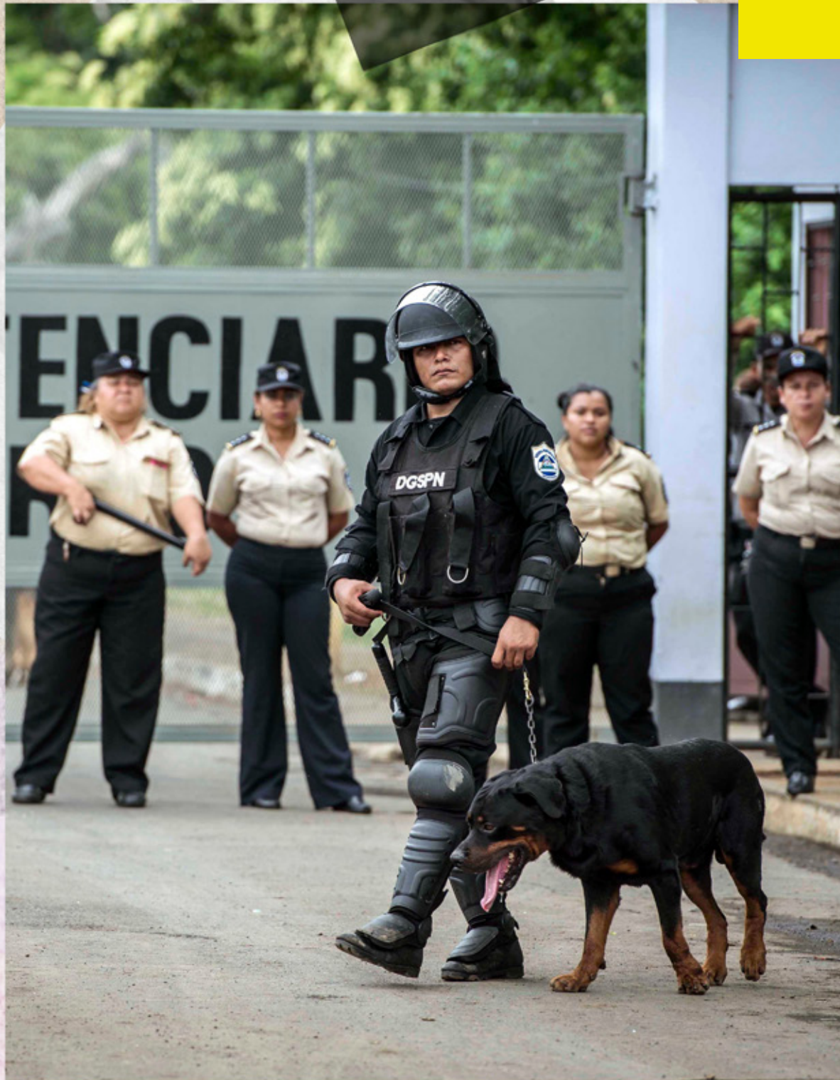
Police officers guard a government building in Nicaragua (2018)

Despite the revocation of the social security reform and the call for a National Dialogue mediated by the Episcopal Conference of Nicaragua, violence by the government and parastatal groups 3 did not stop. As a result, groups of protestors erected barricades and roadblocks that