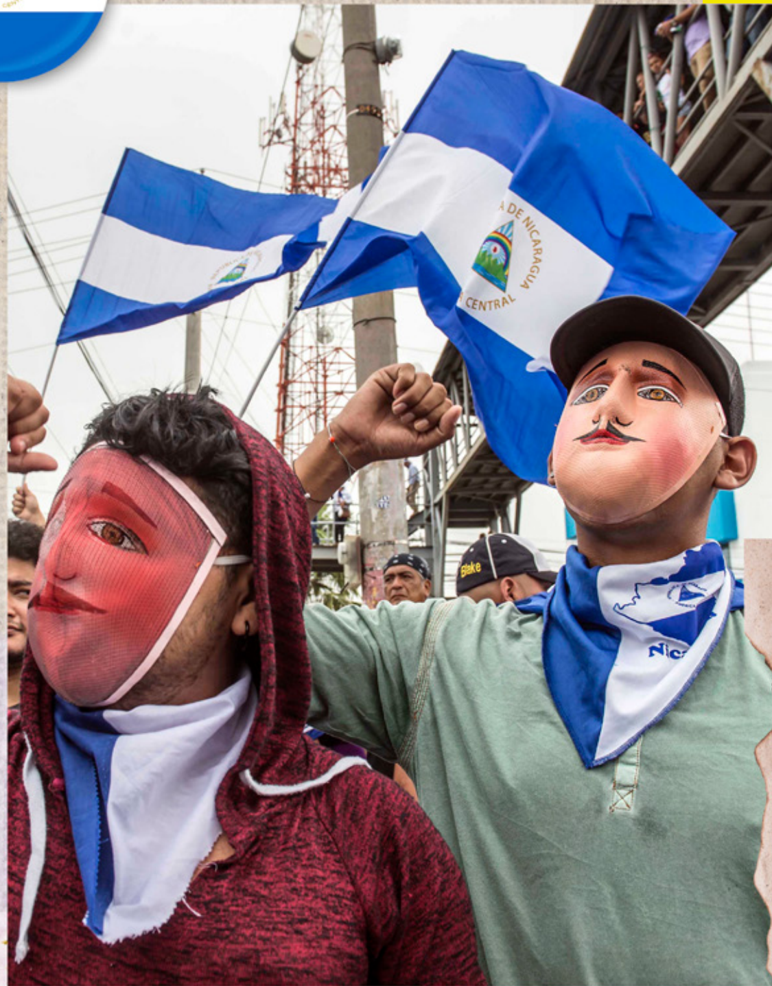
Nicaraguans wear folkloric masks during the protests of 2018” (2018)