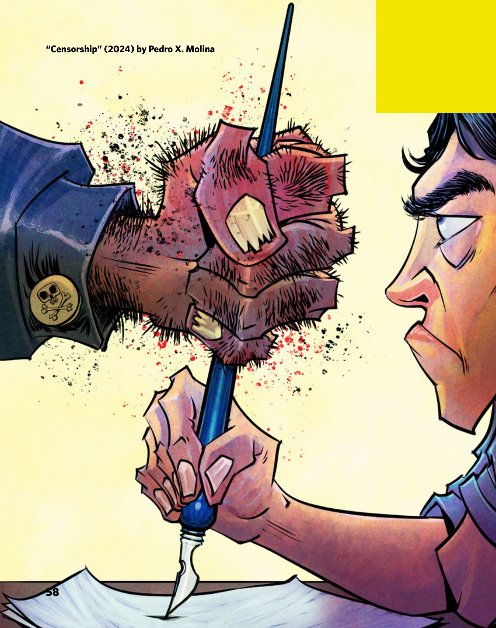
"Censorship" (2024) by Pedro X. Molina