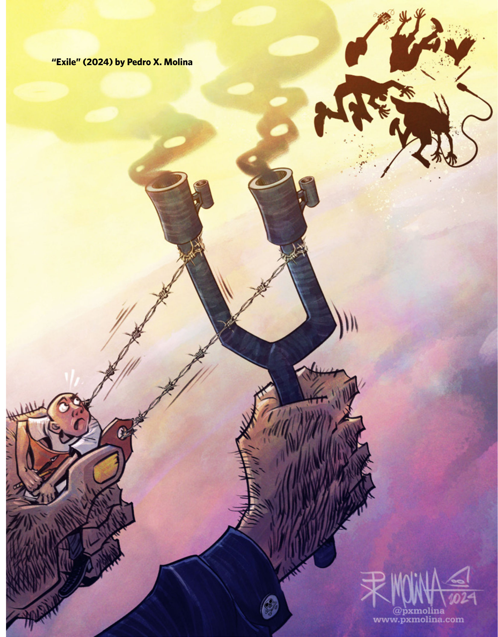
"Exile" (2024) by Pedro X. Molina

CADAL (Centro para la Apertura y el Desarrollo de América Latina) is a private, non-profit, and non-partisan foundation, established on February 26, 2003, in Buenos Aires, Argentina. Its mission is to promote human rights and international democratic solidarity, especially in authoritarian contexts that repress freedom of association, expression, assembly, and political participation, as well as in democracies that face threats to their institutions, civil and political liberties, and the rule of law. As part of its task of promoting human rights, CADAL is a part of a series of coalitions, forums, and organizations that share the same values: the World Movement for Democracy (WMfD), the International Coalition to Stop Crimes against Humanity in North Korea (ICNK), the International Tibet Network, the Coalition for Freedom of Association, the Network of Think Tanks KAS in Latin America, is a member of TrustLaw (the global pro bono program of the Thomson Reuters Foundation), and is registered as an Organization of Civil Society before the Organization of American States (OAS).