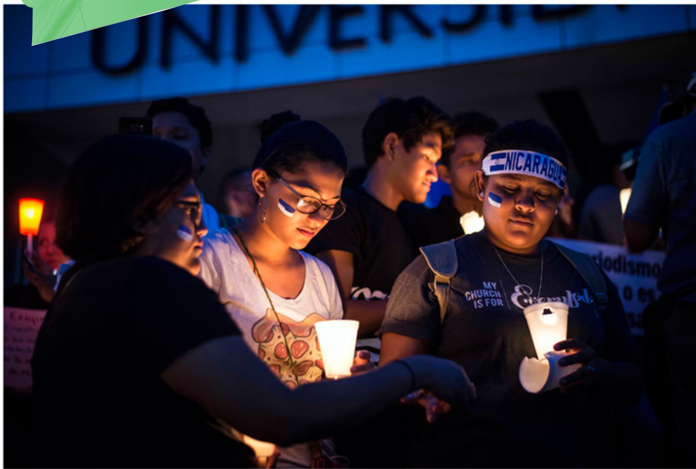
Nicaraguans join a candlelight vigil for those killed during the 2018 protests (2018)

In August 2018, the singer-songwriters Carlos and Luis Enrique Mejía Godoy left Nicaragua for Costa Rica after being warned that they would likely be targeted by the Ortega-Murillo administration for voicing their support of the protests. The Mejía Godoy brothers are renowned in the music industry for their extensive body of work, and they are beloved in Nicaragua for the iconic songs they wrote in support of the 1979 revolution, including Carlos’s famous anthem Misa Campesina Nicaragüense . Moved by the demonstrations of 2018, the brothers composed several songs in support of the pro-