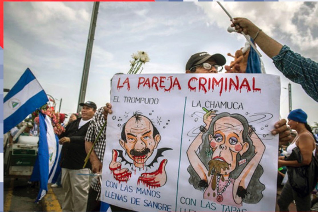
Protest art (2018)

legislation. Though Ramírez served as Daniel Ortega's Vice President from 1985 to 1990, he has been a staunch critic and political opponent of Ortega since 1995. Ramírez also served as the long-time director of Fundación Luisa Mercado , an organization that works on arts and cultural projects, including the renowned festival Centroamerica Cuenta , which brings together Spanish speaking authors from Latin America and Spain to celebrate their literary achievements. On June 1, 2021, the Nicaraguan National Prosecutor's office announced that Fundación Luisa Mercado was under investigation for the alleged money laundering of funds from international donors to support the presidential campaign of Cristiana Chamorro. 117 On September 8, 2021, the Nicaraguan Public Ministry implicated Ramírez in the case, though they did not provide evidence that substantiated the allegations against Fundación Luisa Mercado nor Ramírez's involvement. The office charged Ramírez with "conspiracy to undermine national integrity," through "acts that promote and incite hatred and violence," under Law No. 1050. 118 One day later, an arrest warrant was issued for Ramírez, who was abroad at the time. Facing imprisonment on false charges if he were to return, Ramírez announced that he would not return to Nicaragua and would remain in Spain, where he now holds citizenship.