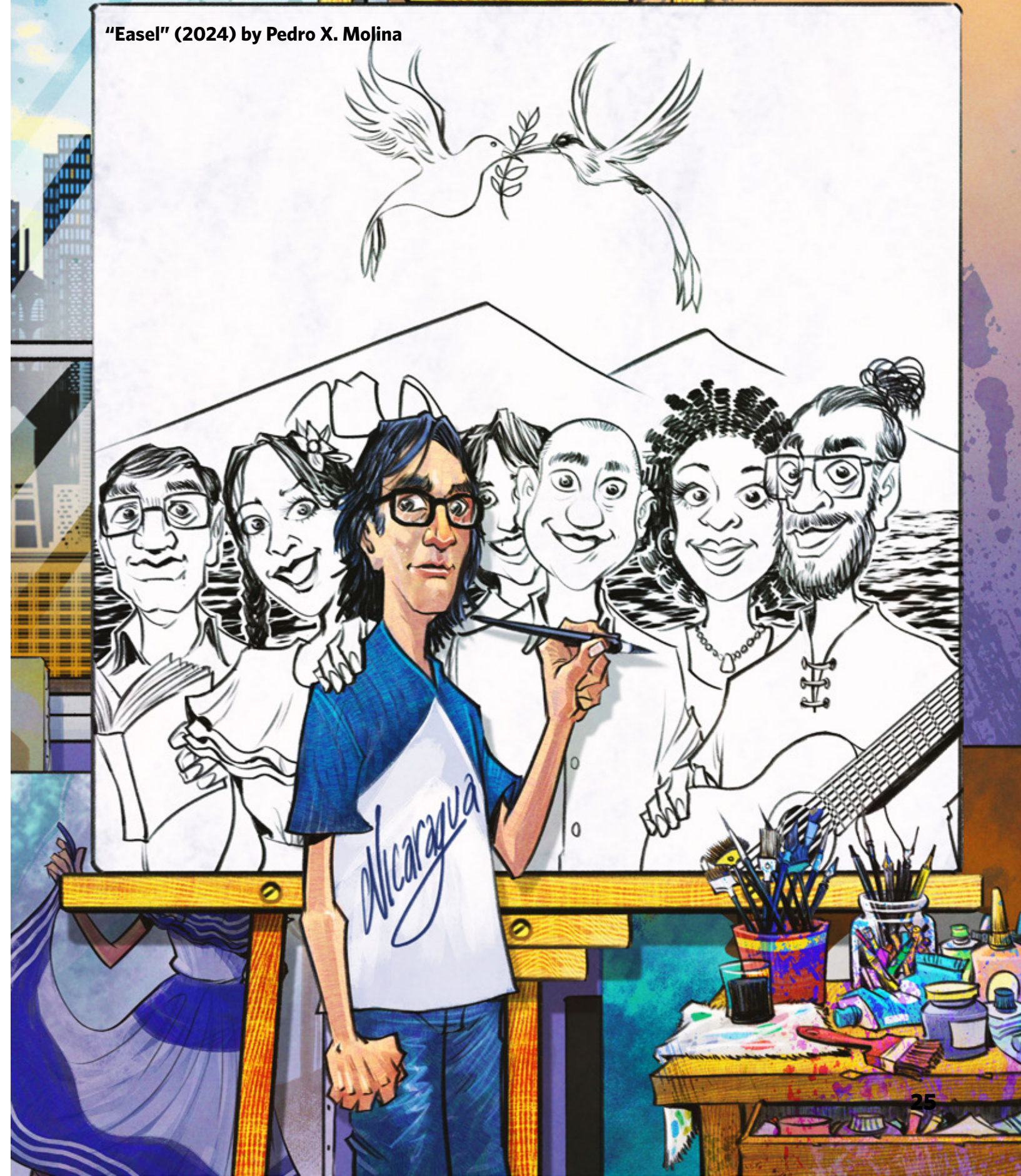
“Easel” (2024) by Pedro X. Molina

The testimonies shared with AFI and CADAL highlight the artists and cultural workers’ fierce dedication to the cause of artistic freedom. Their willingness to organize clandestine arts activities for the benefit of the community despite the ongoing threats of harm they face emphasize the vital role that art played as a method to express dissent and resistance against tyranny.