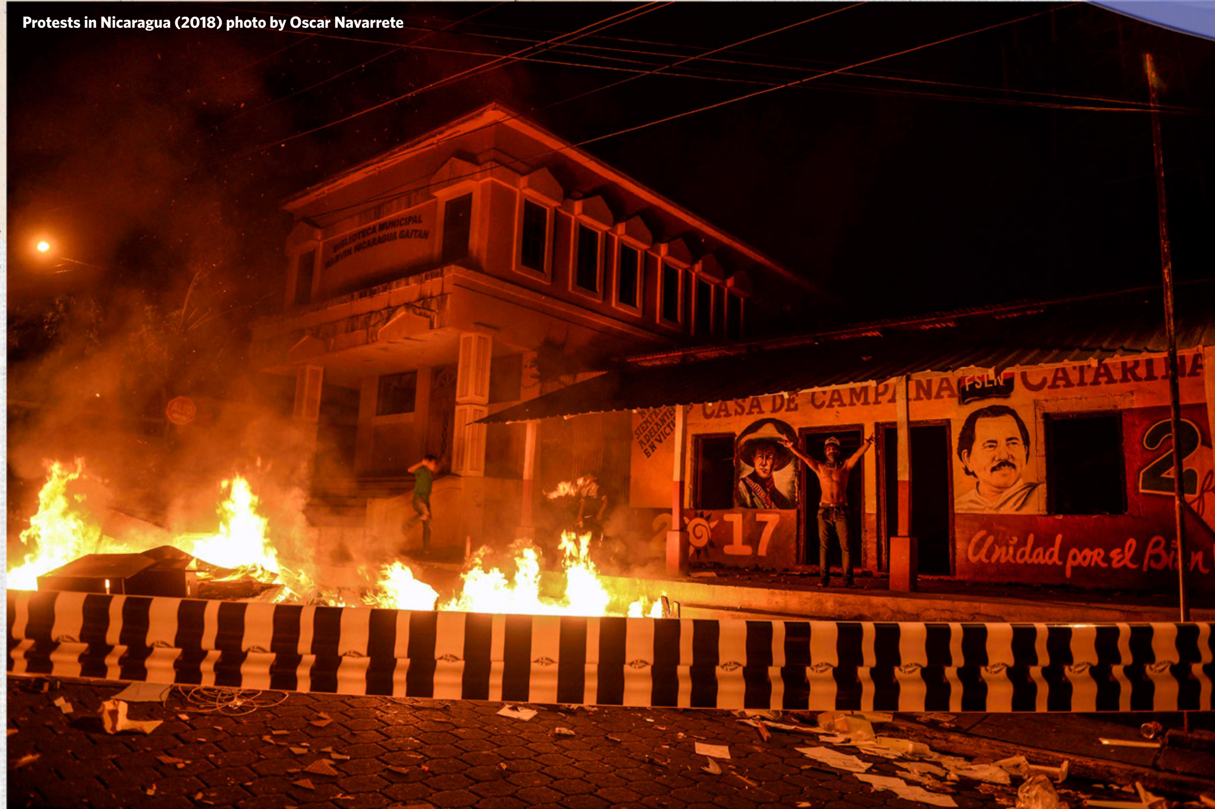
Protests in Nicaragua (2018)